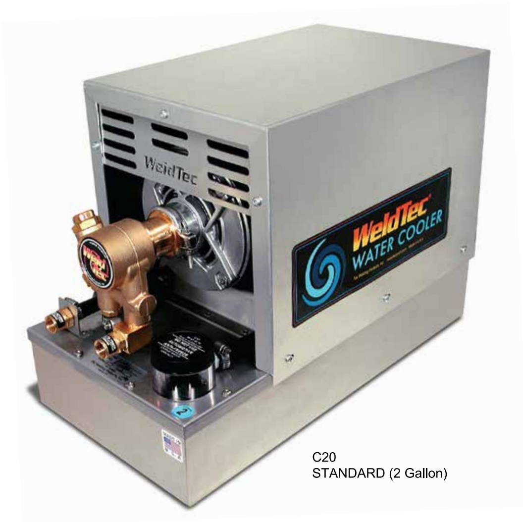
C20 STANDARD (2 Gallon)

TEC WELDING PRODUCTS, INC. P.O. Box 1870 • San Marcos, CA 92079 • Phone 760-747-3700 www.tectorch.com www.weldtec.com